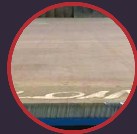
SHEETS AND PROFILES