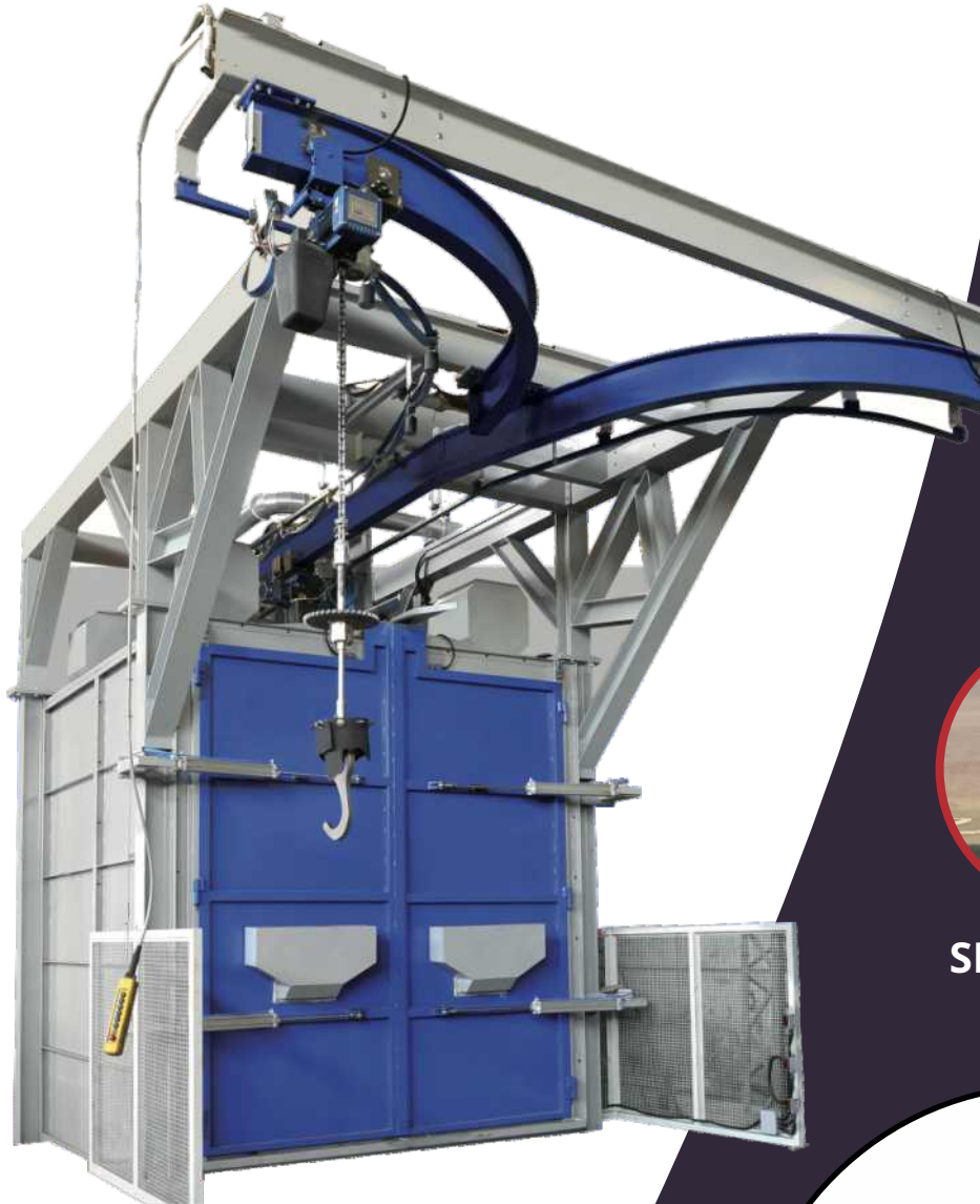
Automatic Hook Type Blasting Machine