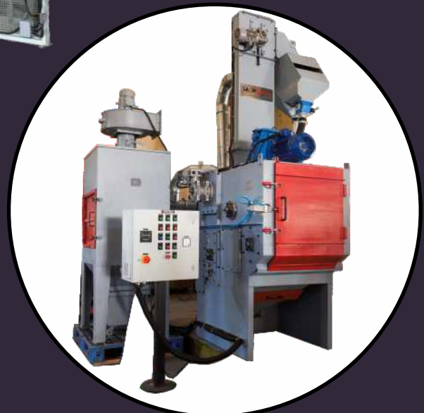
Tumble Belt Blasting Machine